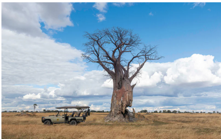
Aside from game drives, Okavango in Botswana manages to keep vehicle density low