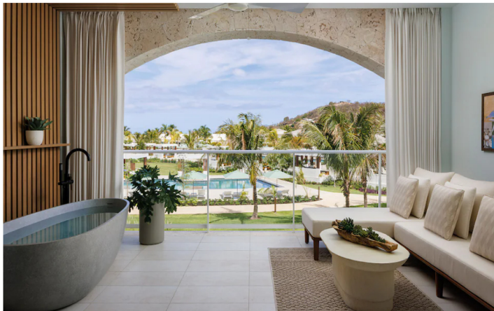
Feel at one with nature by booking a Sandals’ Garden Suite

Find a tropical oasis on the Caribbean isle of Saint Vincent and the Grenadines, from the award-winning Sandals. Home to 32 islands and cays, the latest adults-only Sandals resort opened its doors in March this year joining neighbouring islands Jamaica, Saint Lucia, The Bahamas and Barbados to name a few.