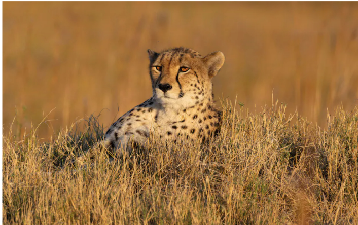
Enjoy the thrilling sight of a cheetah while on a sustainable safari here

We also went on walking safaris and explored the Delta’s waterways in canoes called mokoros, traditionally constructed from dug-out tree trunks but now made of fibre-glass so the forests can be preserved.