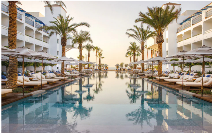
Bask in the Spanish sun with a clear conscience at CEE-certified resort, METT Marbella

Amid the magical Andalucian mountains, with views of Gibraltar and the tip of North Africa on a clear day, the METT Marbella is a paradise hideaway. Set in the tranquil town of Estepona in southern Spain's Marbella, where visitors can venture for cobblestoned walks in the old quarter, the hotel's interiors feature traditional Andalucian details mixed with modern minimalism for a clean finish.