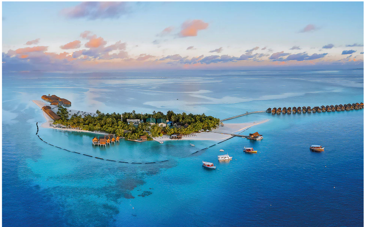
Overwater villas made of recycled materials are part of the commitment to responsible tourism at the Maldives' Constance Moofushi resort.