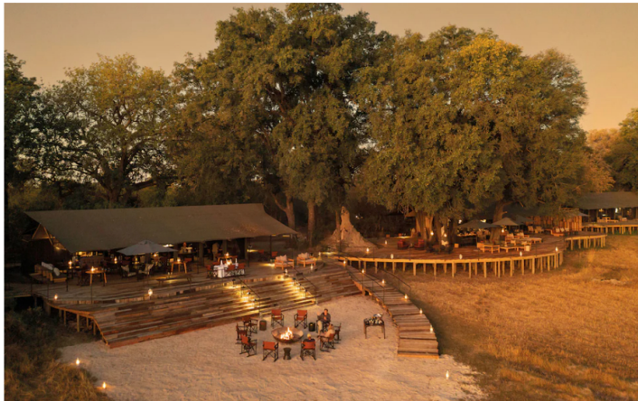
Kick back and sip sundowners around the firepit after a day's safari at Machaba's Kiri Camp on the Okavango Delta

There's nothing like staying under canvas in a fenceless camp for an authentic, immersive African safari experience. We stayed in three such camps in the Okavango, a game-rich inland delta in Botswana, run by sustainable safari specialists Machaba. Each resort varied in size, ranging from the diminutive Little Machaba which had just four tents to the larger Gomoti and Siri which could accommodate up to 24. Machaba, which has six camps in the Okavango with another due to open next year, prides itself on offering unforgettable game experiences while leaving the lightest footprint in the bush.