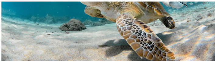
Holidaymakers can participate in the rehabilitation of turtles to the Caribbean Sea in Jamaica

Guests are encouraged to get involved with the Sandals Foundation . The Caribbean Islands branch gives back to the local communities that have welcomed the resort. Founded in 1981, holidaymakers can experience the continent's vibrant culture through a new philanthropic lens, whether participating in the rehabilitation of turtles back to the Caribbean Sea in Jamaica or venturing on a Reading Road Trip to nurture the comprehension of young children. With the option to roll up sleeves and help planting the school gardens, it'll be a trip adventurers will forever cherish. For the latest prices and offers, call 0800 742 742 or visit sandals.co.uk