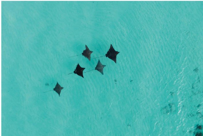
A formation of dancing manta rays is a regular sighting on a BlueTribe dive in the Maldives