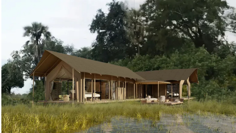
Monachira Lodge, located in the Moremi Game Reserve, features two family tents, above, and eight twin tents.