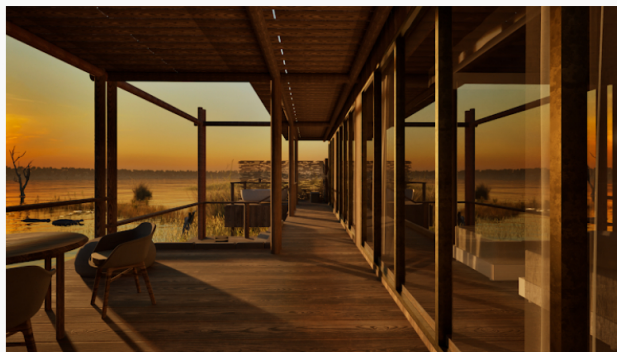
Baines Lodge Deck at sunset