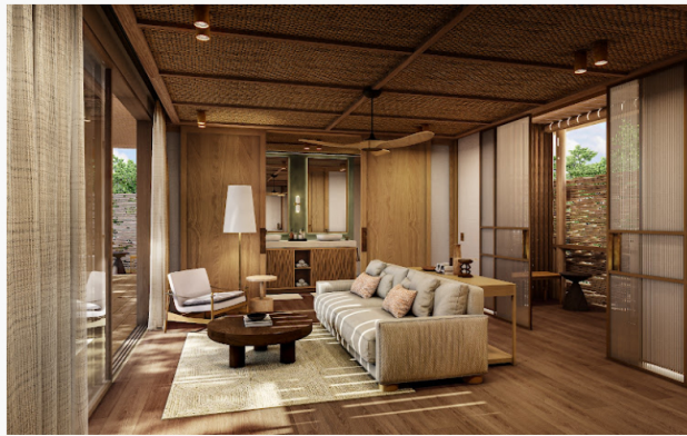
Baines' Unit Lounge