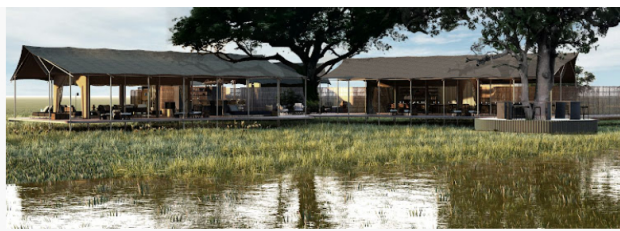
Monachira Lodge main area