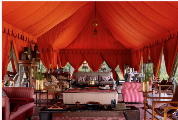
Mbamba Camp interior

Located within the wildlife-rich Moremi Game Reserve, Monachira Camp takes its cue — and its name — from the Monachira Channel that flows alongside, offering guests the opportunity for memorable water-based adventures in flood season.