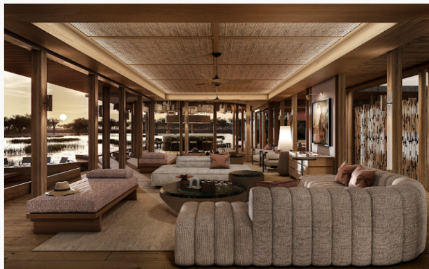
Baines' Main Lounge