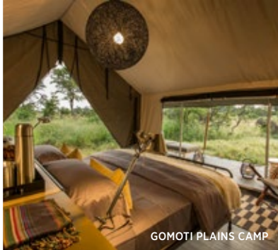
GOMOTI PLAINS CAMP