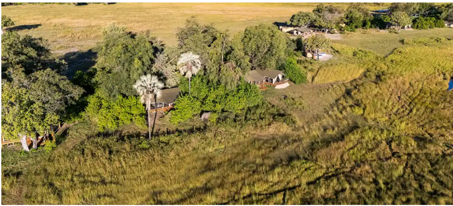
The camp has incredible views over the floodplains.