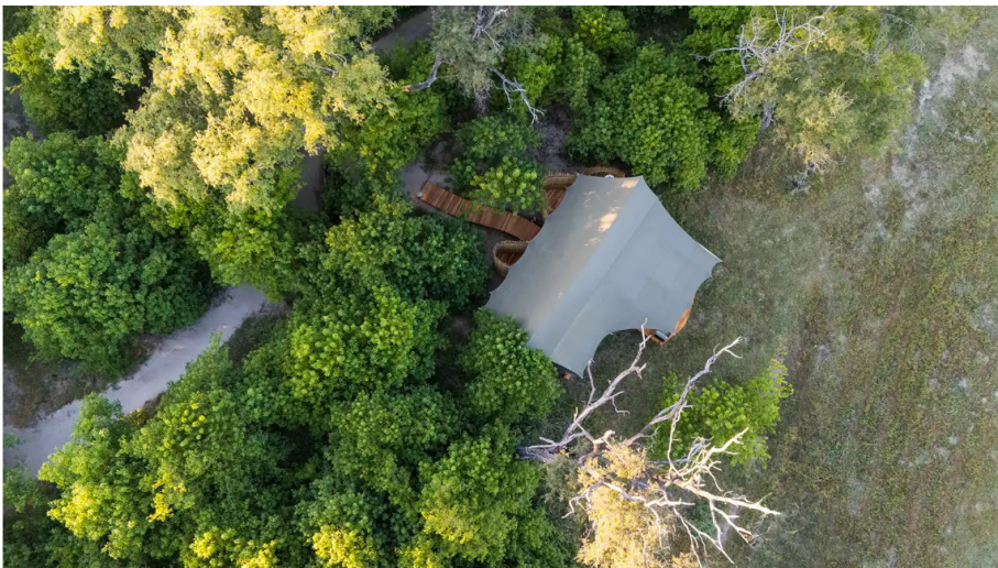
A sandy, treelined path leads to the tented suites.

"Sustainability wasn't just a consideration — it guided the whole design," says Lisa. "The camp has a very light footprint and was carefully positioned between existing trees, so we didn't have to clear large areas. The idea was to let the landscape lead and to build around it rather than over it. My main inspiration behind the build and structures came from the river. Its movement, textures, and softness really shaped the look and feel of the camp. The woven reed elements echo the papyrus and grasses you see along the waterways, and there's a strong focus on natural materials and simple forms. We wanted it to feel calm, organic, and almost like it grew out of the terrain."