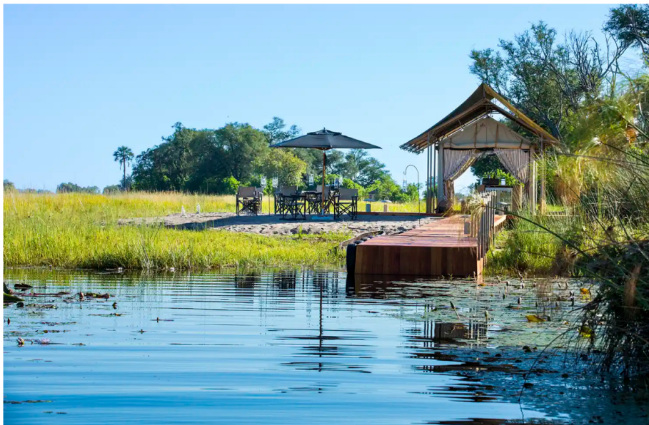
The sunset bar and boat jetty.

Warmly welcomed with song and dance by members of the team, the front of house manager, Manila, shows me to the dining area. Meals are served here and are expertly prepared by a team of chefs. There is no shortage of food at Monachira Camp. The day starts with 'the most important meal of the day' – breakfast before safari, followed by brunch, then high tea, and ending your day with dinner, which is a gastronomical delight. Great care is taken to produce healthy and delicious food, which goes a long way in ensuring a great stay.