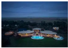
Live Your Wildest Dreams At The Ritz-Cariton, Masai Mara Safari Camp