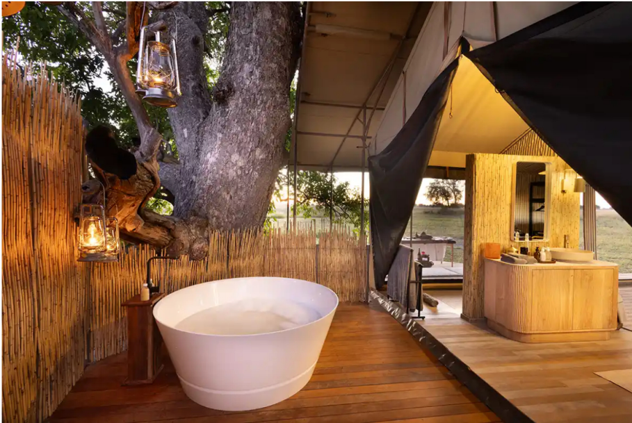
The stunning indoor and outdoor bathrooms.

My tented suite is beautifully furnished in a mix of beiges, black and white stripes, and mustard, adding a dollop of color. Using a striped lining in the interiors adds a contemporary twist to the usual khaki. Andrew was inspired by the reeded river fish traps and surrounding grasslands, as well as the tannin color of the water in the area. The architectural team implemented locally sourced materials, including letaka (reed), and kept the color palette neutral for the camp to blend into the bush. Structures were intentionally kept lightweight, with open views and generous decks so that guests feel immersed in nature at all times.