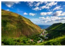
The Secret Of The South Atlantic – Discovering St Helena Island