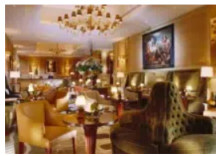
Principe di Savoia Milan: Italian Luxury Redefined