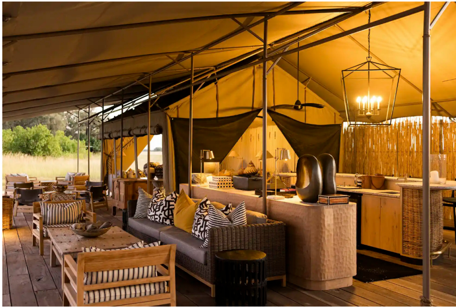
The main bar and lounge area.

Looking out the window from the comfort of my airline seat, I have never seen Botswana so lush and green. The recent rains and floods have turned the landscape into a tapestry of emerald, with trees towering across the topography. After having my passport stamped by a friendly immigration official, I step into the arrivals hall to scan for a signboard with my name on it. What was supposed to be a fixed-wing aircraft transfer with Mack Air has turned into a flight with Helicopter Horizons ! How lucky am I? Commercial Pilot Zakai starts the Robinson R44, and 25 minutes later, we land right in front of Monachira Camp.