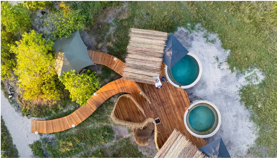
There are two pools at Monachira Camp.