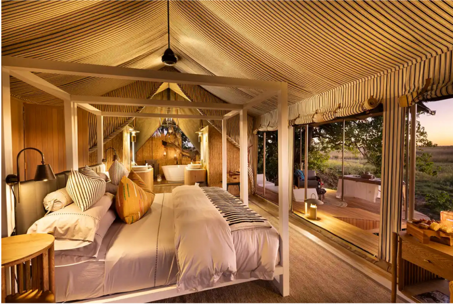
Tented Suite number 10.

screening is positioned to create natural privacy between units. It makes the experience feel much more exclusive and peaceful."