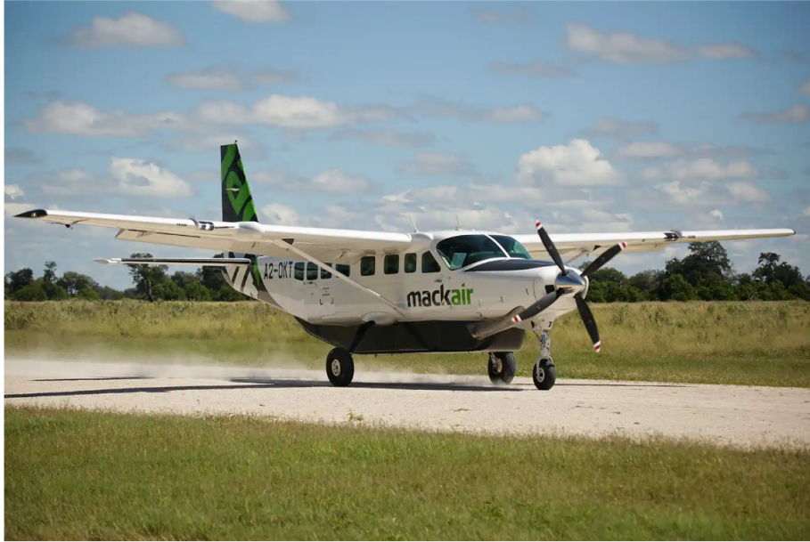
Getting between camps has never been easier.

Guests at Monachira Camp can choose from a variety of activities – there are game drives, mokoro (dug-out canoe, water level dependent), nature walks, and the aforementioned boating safari, also subject to water levels. Spending my last morning on the Monachira channel, it's such a different perspective being on the water. As KG steers the speedboat, two elephants are immersed in the channel with only their heads and trunks sticking out. They emerge from the water, their bodies shiny from the cooling substance they clearly enjoyed.