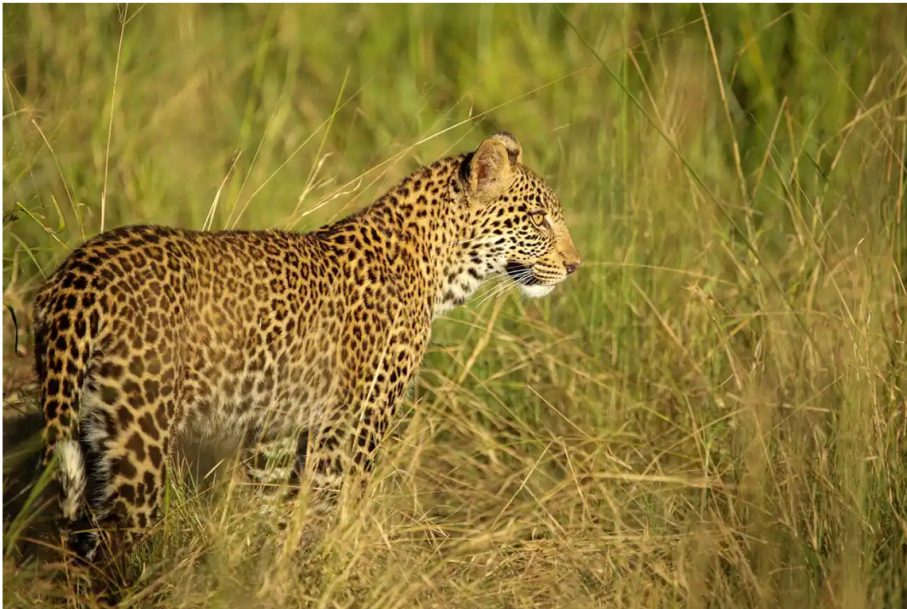
A leopard cub in the early morning light.

What would a stay at a safari lodge be without going out to see which wildlife inhabit the area? Moremi Game Reserve is known for being one of the most picturesque reserves in Botswana, and guide Harold is keen to embark on our first safari. This afternoon, we're heading in a southerly direction. Some of the areas are inaccessible due to the heavy rains, so we go where we (hopefully) won't get stuck in the mud. We find an elephant feeding on a marula tree, a Woodland Kingfisher at the end of a bare tree branch, a side-striped jackal hiding in the tall grass, and a mating pair of lions! The male has a gorgeous mane, and it looks as though he's just been to the hairdresser.