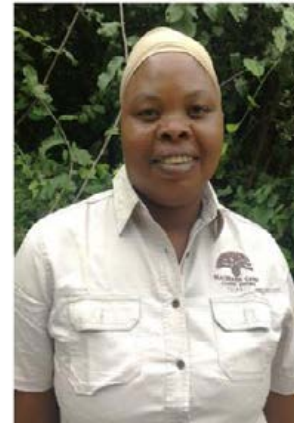
MATSHELO House Keeping