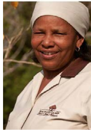
OD House Keeping