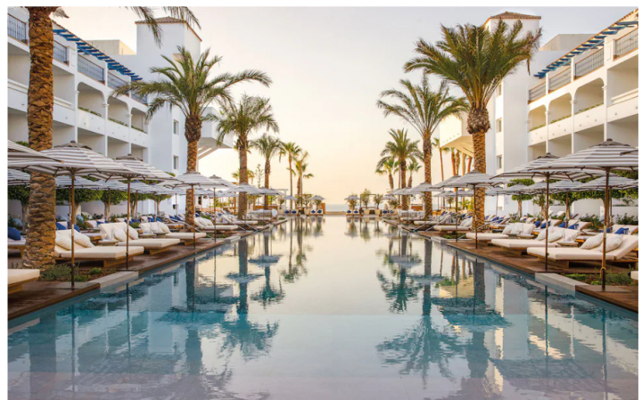
Bask in the Spanish sun with a clear conscience at CEE-certified resort, METT Marbella

Amid the magical Andalucian mountains, with views of Gibraltar and the tip of North Africa on a clear day, the METT Marbella is a paradise hideaway. Set in the tranquil town of Estepona in southern Spain's Marbella, where visitors can venture for cobblestoned walks in the old quarter, the hotel's interiors feature traditional Andalucian details mixed with modern minimalism for a clean finish.