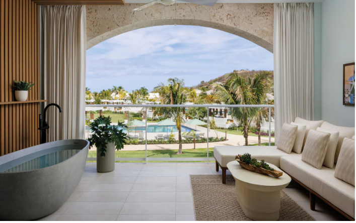
Feel at one with nature by booking a Sandals' Garden Suite

Find a tropical oasis on the Caribbean isle of Saint Vincent and the Grenadines, from the award-winning Sandals. Home to 32 islands and cays, the latest adultsonly Sandals resort opened its doors in March this year joining neighbouring islands Jamaica, Saint Lucia, The Bahamas and Barbados to name a few.