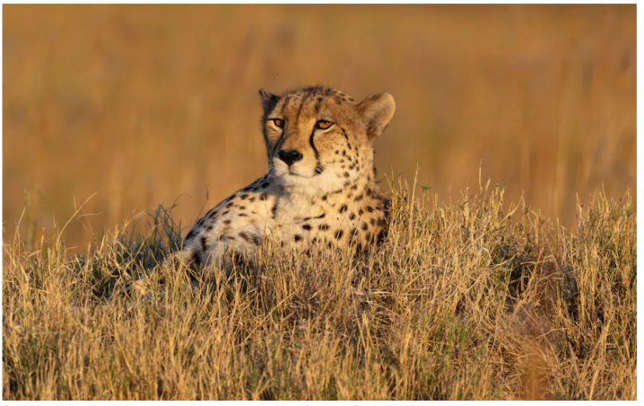
njoy the thrilling sight of a cheetah while on a sustainable safari here

We also went on walking safaris and explored the Delta's waterways in canoes called mokoros, traditionally constructed from dug-out tree trunks but now made of fibre-glass so the forests can be preserved.