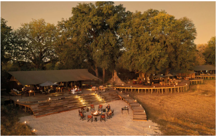
Kick back and sip sundowners around the firepit after a day's safari at Machaba's Kiri Camp on the Okavango Delta

There's nothing like staying under canvas in a fenceless camp for an authentic, immersive African safari experience. We stayed in three such camps in the Okavango, a game-rich inland delta in Botswana, run by sustainable safari specialists Machaba. Each resort varied in size, ranging from the diminutive Little Machaba which had just four tents to the larger Gomoti and Siri which could accommodate up to 24. Machaba, which has six camps in the Okavango with another due to open next year, prides itself on offering unforgettable game experiences while leaving the lightest footprint in the bush.